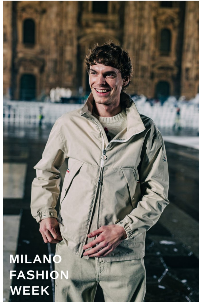
Milan Fashion Week Moncler x Luisa Via Roma AW23