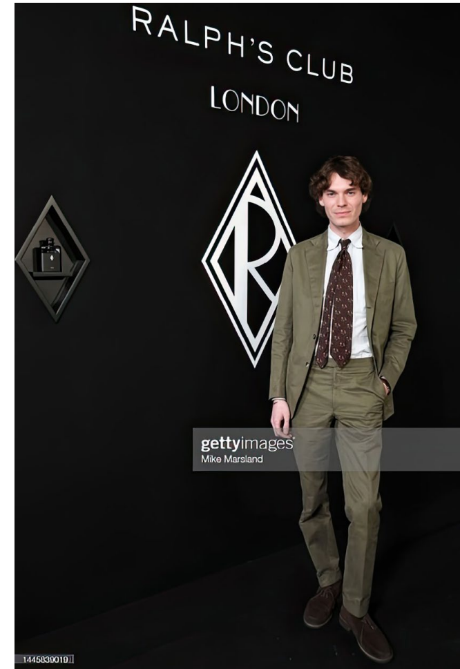
Ralph's Club By Ralph Lauren Event November 2022