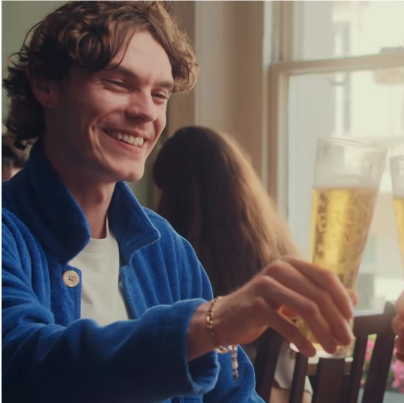
Peroni UK x Royal Ascot