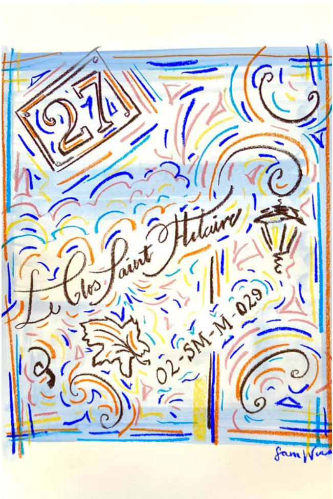
Billecart Salmon Champagne Permanent display at the Billecart Salmon Estate