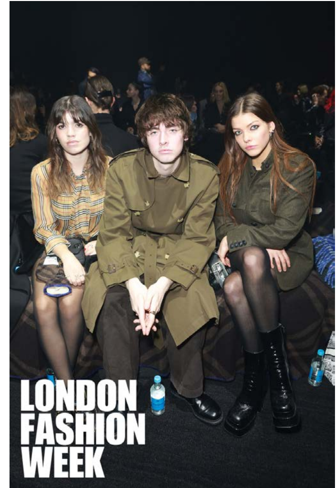
London Fashion Week, Burberry AW23