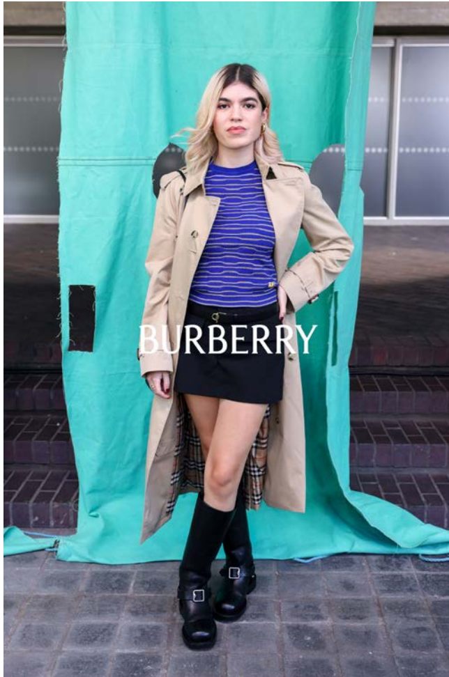
London Fashion Week, Burberry SS25