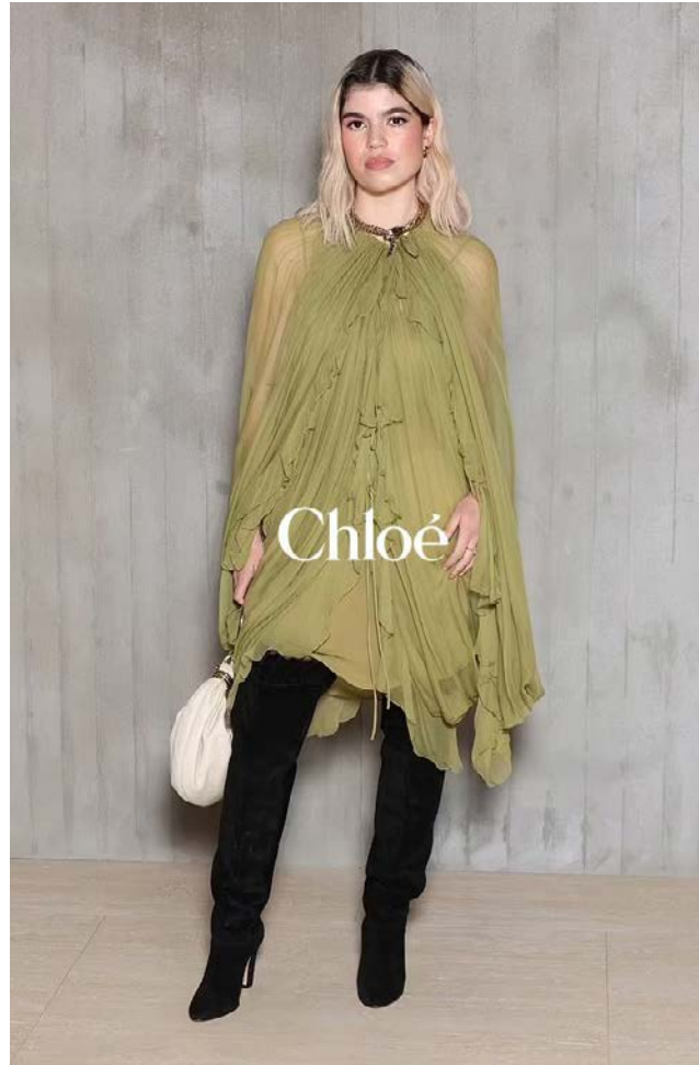
Paris Fashion Week, Chloe SS25