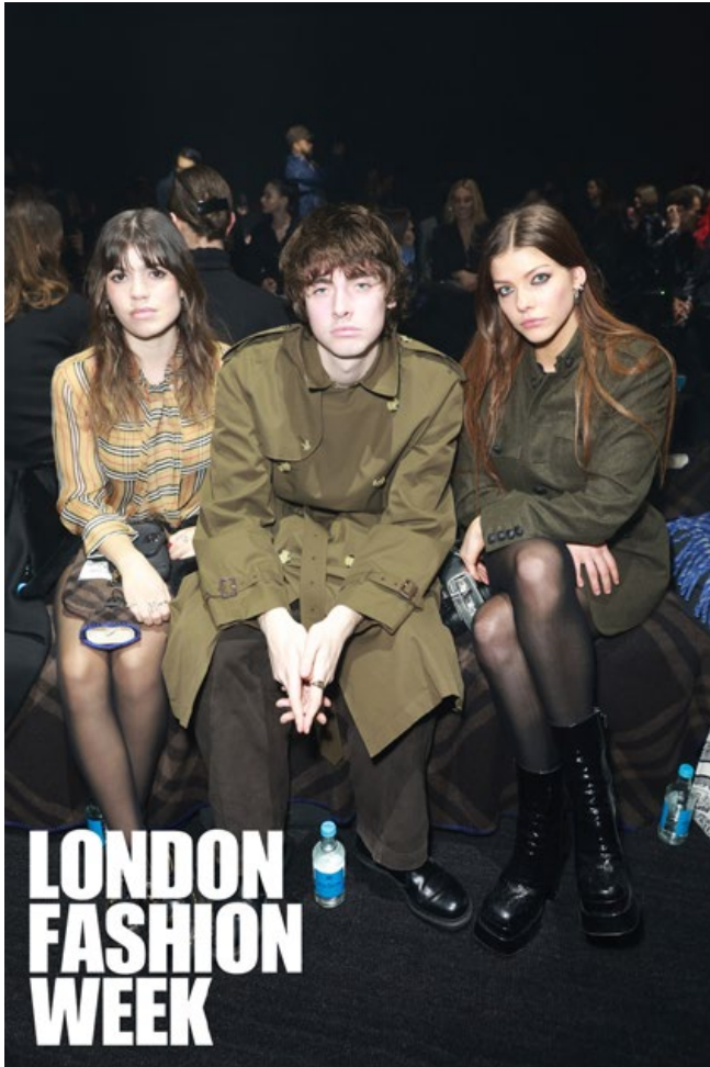
London Fashion Week, Burberry AW23