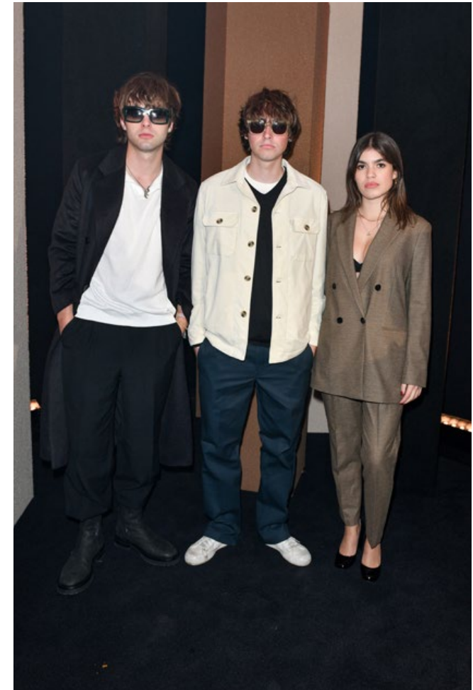
Boss Store Opening Party, Oct 2022