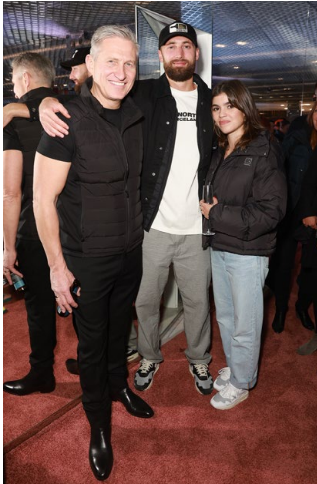
66 North Store Opening, Dec 2022