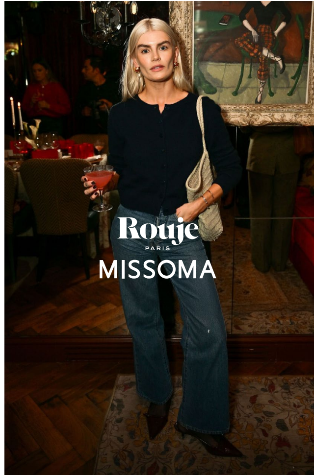
Rouje x Missoma Launch Dinner