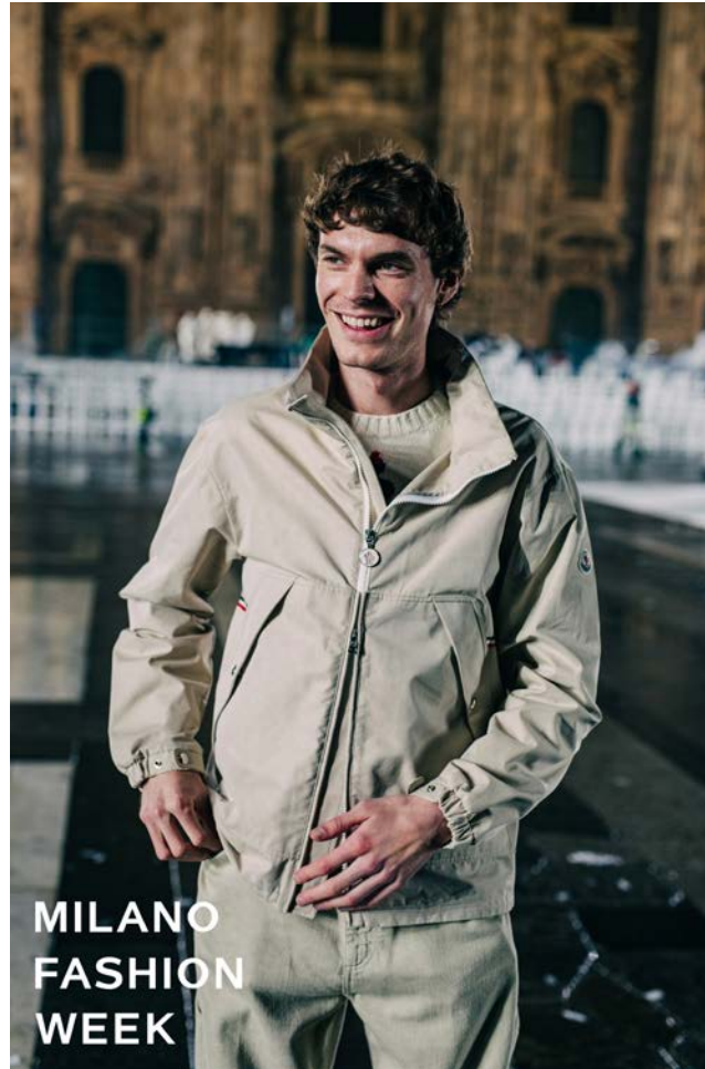
Milan Fashion Week Moncler x Luisa Via Roma AW23