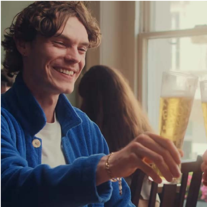
Peroni UK x Royal Ascot