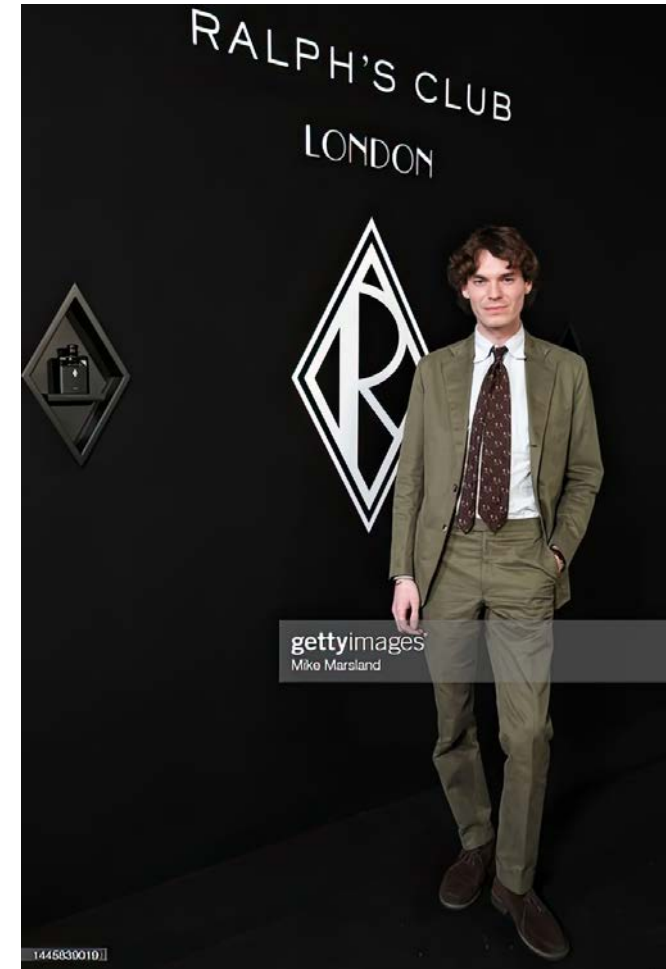
Ralph's Club By Ralph Lauren Event November 2022